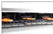
Partial pressure cancel mechanism

Equipped with a mechanism that enables media transport in optimal conditions. Combine with a take-up unit and media holder for smoother media handling capability.