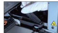
Replaceable cleaning wiper