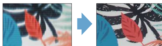
[Before feed correction]

By printing a print pattern and reading it with a sensor, paper feed correction is performed automatically.