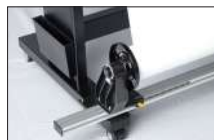
Media holder for feed (optional)