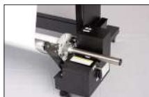
30kg take-up unit (optional) 20kg unit is also available.