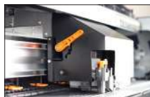
Three head height settings